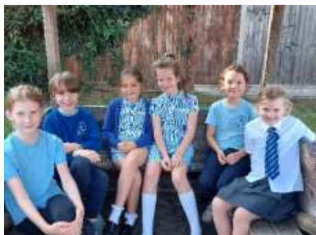
Worship, Vision and Values